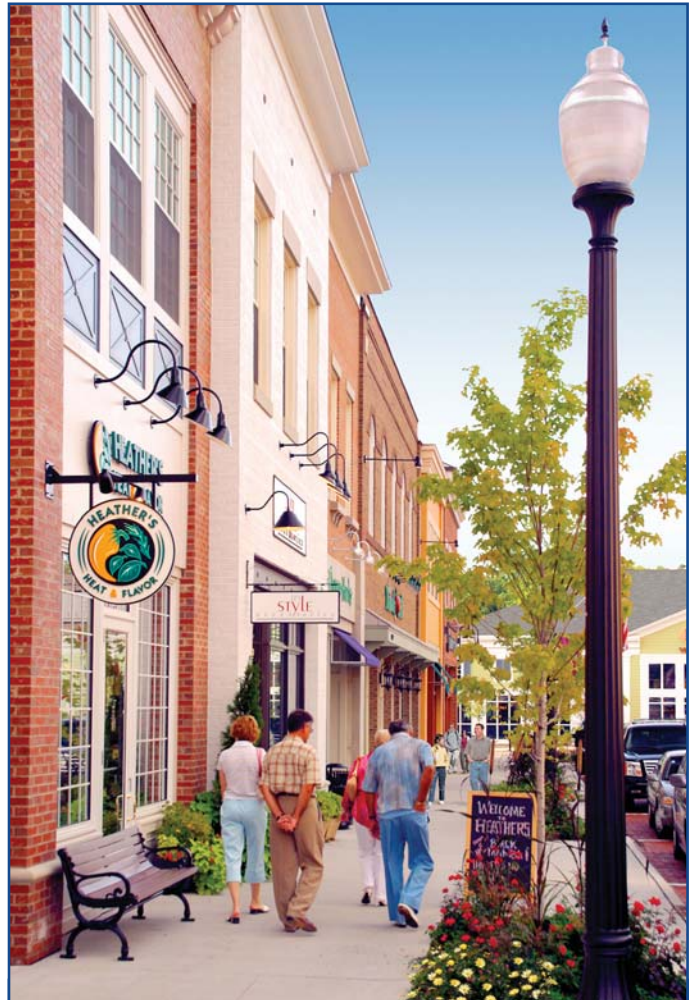
TES Engineering provided MEP design services for Dorsky Hodgson Parrish Yue's First & Main development in Hudson, Ohio.

This background gives TES a strong understanding of the landlord/developer's needs as well as the tenant's needs, plus first-hand knowledge of the potential glitches and delays that can hurt the bottom line. TES has optimized its retail activities to keep fees down and service up. It has a proven track record in helping clients reduce time